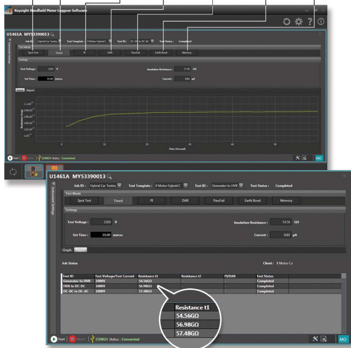
Job Status Reporting View

Spot Test Timed Test PI Test DAR Test Pass Fail Earth Bond Memory