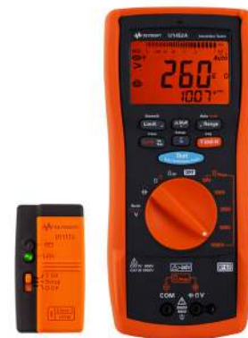
Figure 4. U1117A IR-to-Bluetooth Adapter enables wireless remote testings with the U1450A/U1460A series