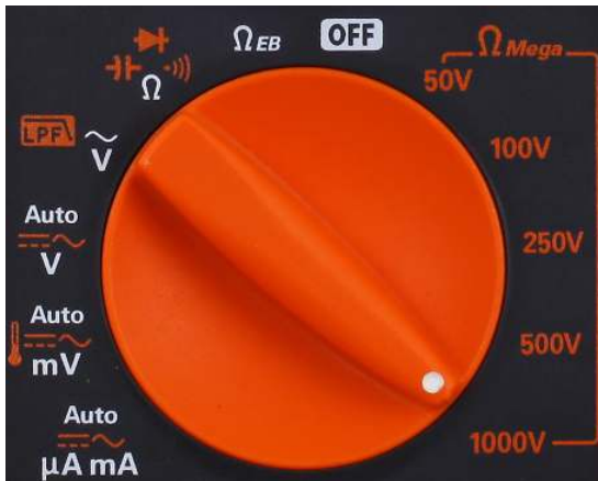
Figure 6. Insulation resistance tester with full featured DMM