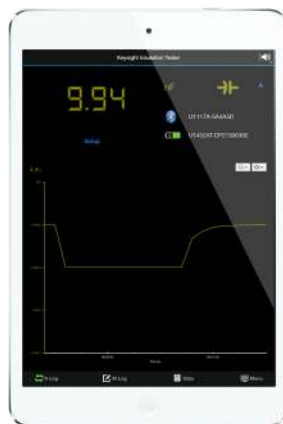
Figure 3. Data logging interface on Keysight Insulation Tester Application