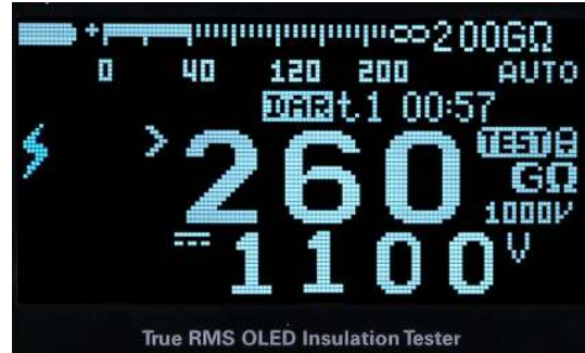
Figure 5. Adjustable insulation test voltage up to 1.1 kV

The adjustable insulation test voltage from 10 V to 1.1 kV in 1 V steps on selected two models 1 allows you to set precise test voltages catered to unique test application requirements. These typical applications are commercial avionics testing, military communications system testing and production line testing. The standard test voltages from 50 V to 1 kV is also available for selected models 2 .